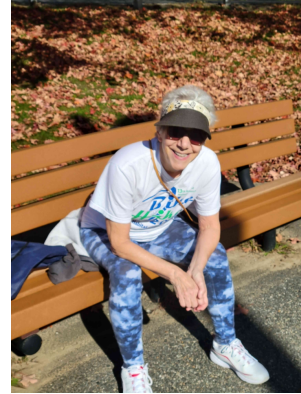
After 5 mi hike.