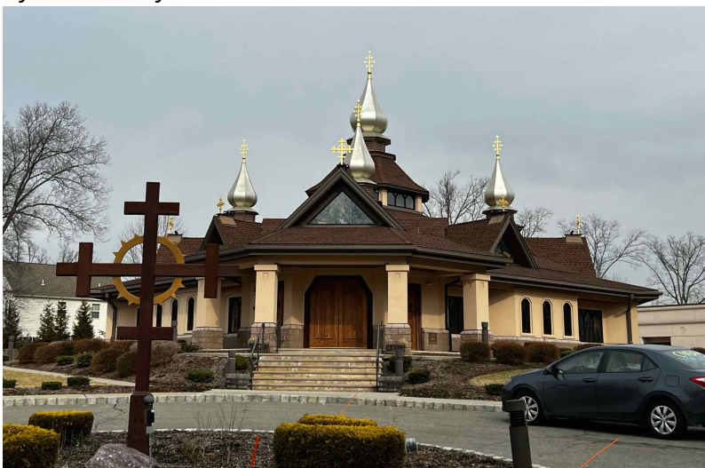
Beautiful Ukrainian church at UACCNJ.

At this time, we will ONLY be accepting aid deemed to be most critical: military and medical items. We have created an Amazon wish list, which contains these high-priority items that Ukraine needs at this time. When ordering items on Amazon, please use the UACCNJ address as the destination. (Go to the website to connect to UACCNJ Amazon wish list or to donate, as well as to find more information of where to donate. The website has been built up very well.